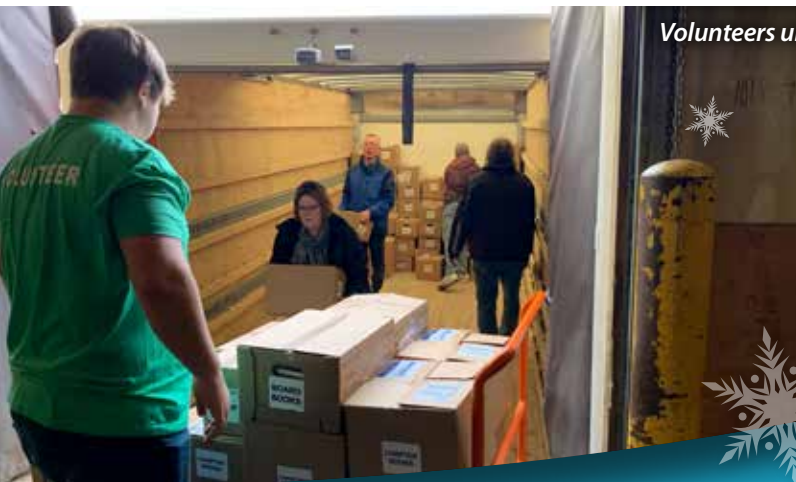
Volunteers unload a trailer full of books for the GAKAB distribution

In case you missed out sharing your love of books in 2023, our Amazon Wishlist is still active. We also accept book donations throughout the year at any Library branch. If you wish to make a financial contribution to GAKAB, please make your check payable to "Friends of the Brown County Library - GAKAB" and mail it to 515 Pine St., Green Bay, WI 54301.